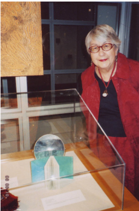
Photos from the opening of the 2010 Annual Members' Exhibition.